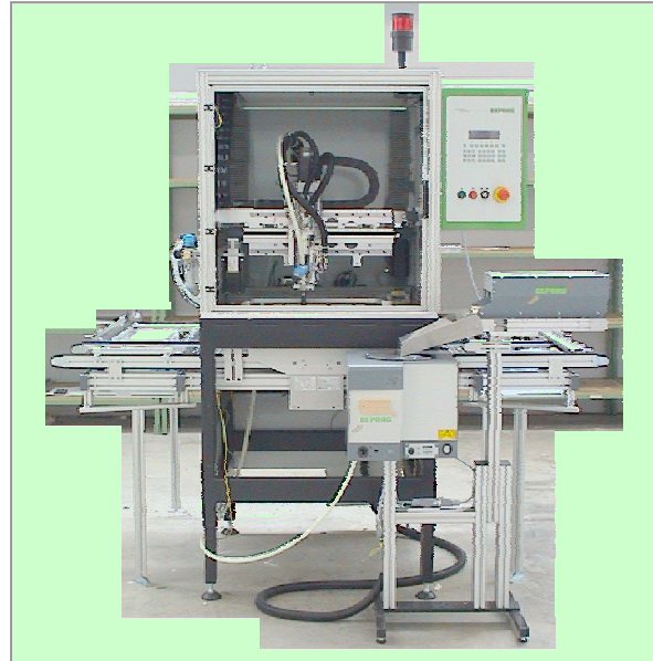
DCAM [DEPRAG Compact Assembly Module]