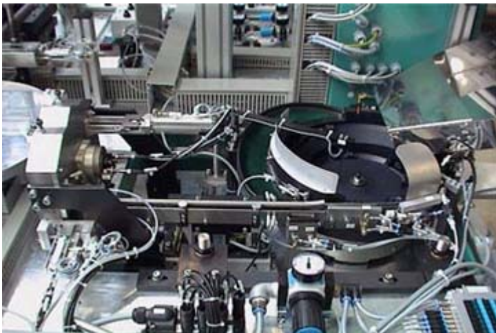
Feeding Device for Plastic Screw

The nut transport presented a different problem. Due to the geometrical shape of the nut, it was necessary to transport the nut "downside-up" and then to turn the nut by 180 degree to allow an accurate vacuum pickup from underneath and the subsequent assembly.