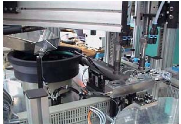
Feeding Device for Plastic Nut

The nut transport presented a different problem. Due to the geometrical shape of the nut, it was necessary to transport the nut "downside-up" and then to turn the nut by 180 degree to allow an accurate vacuum pickup from underneath and the subsequent assembly.