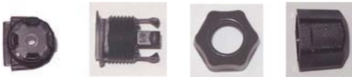
Plastic Screw, 25mm long and 21.5mm wide

The objective of this assembly machine was to feed and assemble a cable strain-relief, using two different components in the form of a plastic screw and a plastic nut, as illustrated below.