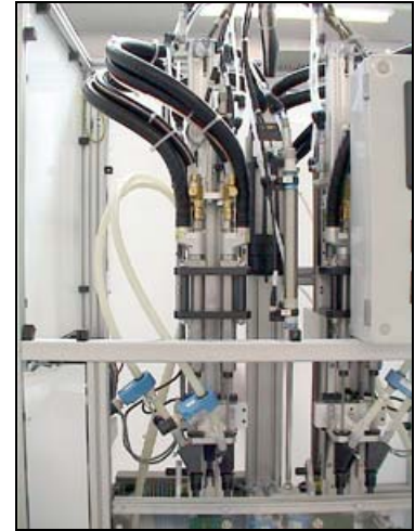
Two Dual SFM [Screwdriver Function Module]