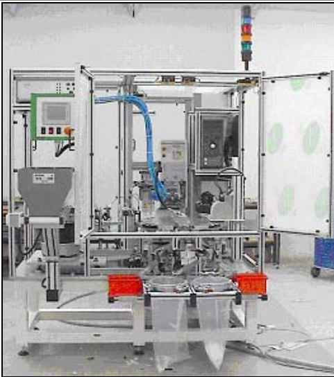
Total Machine View