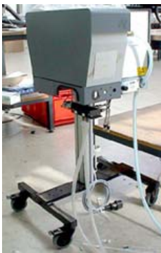
Screwfeeder with Twin-Distributor