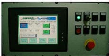
Touch Screen OIT