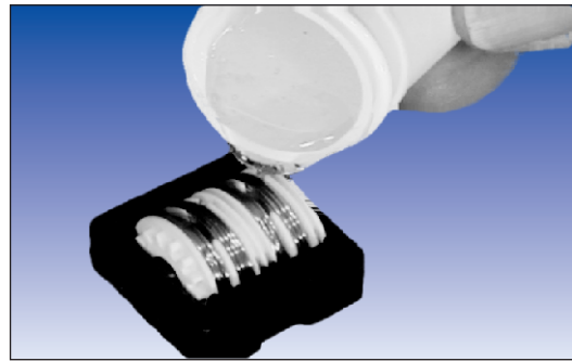
4460 Fully Impregnates a High Temperature Coil