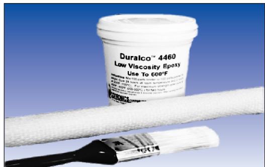
4460 Coats, Moisture Proofs, Seals and Protects Ceramic Sleeving