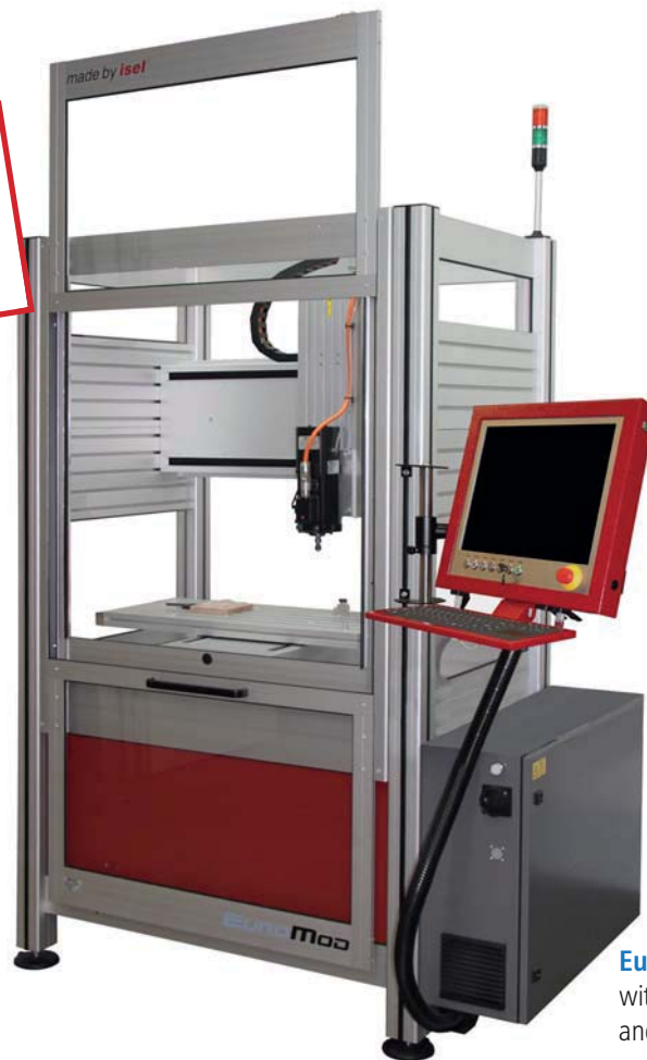
EuroMod MP 45 with control panel iOP-19-TFT and open sliding door