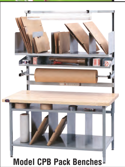
Model CPB Pack Benches