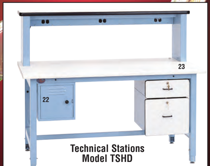
Technical Stations Model TSHD

Risers and Padlock Drawer In Stock in Light Blue