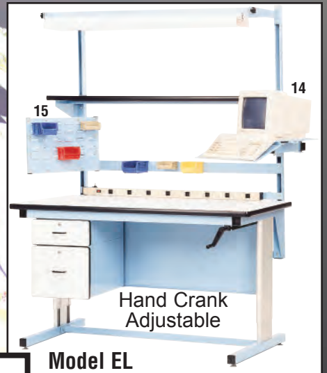
Hand Crank Adjustable