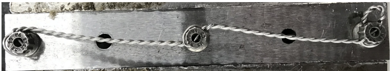
Lock Wire 5.5"

Conclusion: Through the tests performed, it is evident that \emptyset.040 Safe-T-Cable has a significant weight advantage to \emptyset.040 Lock wire. We expect to find similar results in further testing with different size cable and wire.