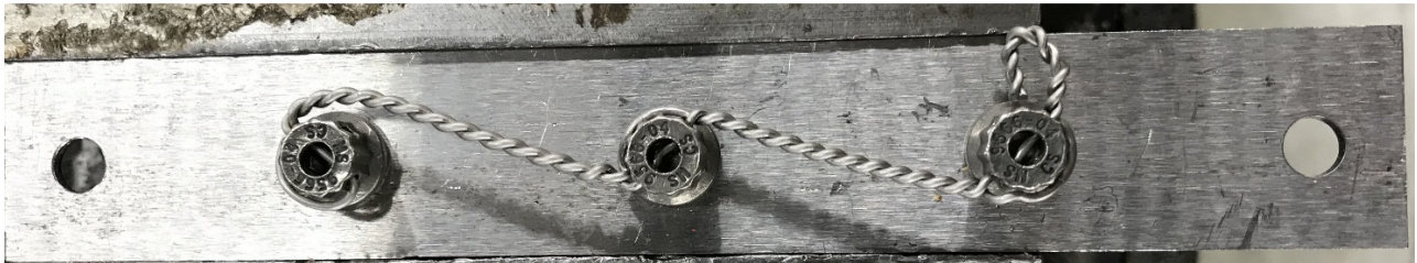
Lock Wire 3"