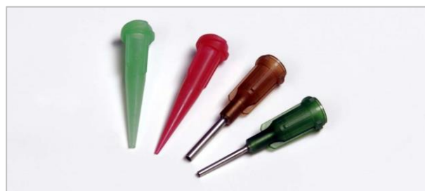
Figure 2. Taper and Needle Dispensing Tips

Manufacturers can select from a wide variety of dispense tips to find the best tip for their specific application. Tips are typically made of stainless steel or plastic. When dispensing light-curable adhesives, plastic dispense tips must be impervious to all light so that the adhesive will not cure in the dispense equipment and create blockages. In certain cases, dispense tips may also be shielded from light to prevent premature cure.