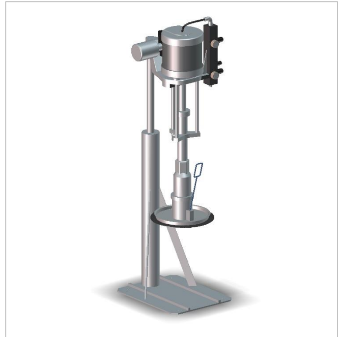
Figure 3. Ram Pump System

If the same type of thixotropic fluid were to be dispensed through a pressure pot, higher pressures would be needed to push the material down. This excess pressure can push air bubbles into the adhesive, or even past the adhesive, which would result in air reaching the valve. It can also cause cavitation, a condition where the adhesive is pushed to the sides of the pressure pot creating a cavity in the center.