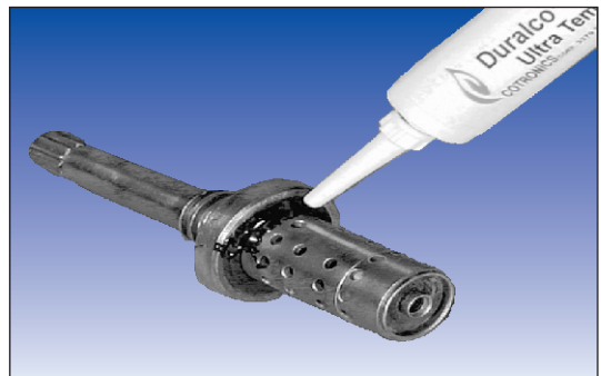
4703 Repairs a Valve Seal